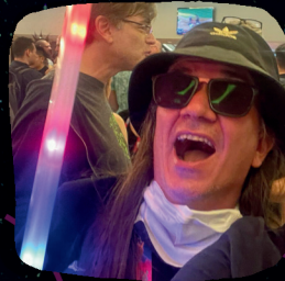
GLENN PEGDEN @GLENNPEGDEN